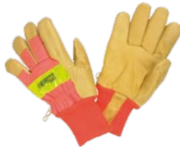
G-135 Reflective Insulated Glove, Genuine Pigskin Leather, Heatkeep Liner & Knit Cuffs, Lime/Yellow Hi-Gloss Trim Sizes: S – 2XL Color: Orange