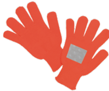
G-125 Hi-Visibility Reflective String Knit Glove, 100% Polyester, Silver Reflective Trim Size: One Size Fits All Colors: Lime/Yellow or Orange