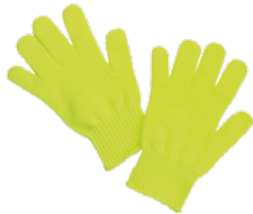
G-124 Hi-Visibility String Knit Glove, 100% Polyester Size: One size fits all Color: Lime/Yellow or Orange