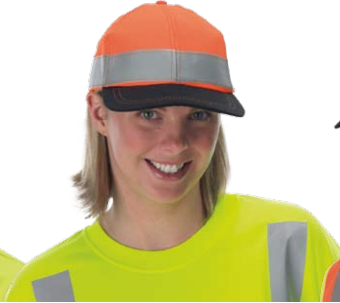
HAT-BC-3M Reflective Ball Cap Low Profile, Adjustable back strap, Silver Reflective Trim Colors: Lime/Yellow or Orange