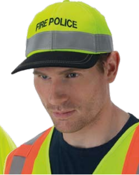
HAT-BC-3M-L Reflective Ball Cap w/ Title Low Profile, Adjustable back strap, Custom Embroidered Titles, Silver Reflective Trim Colors: Lime/Yellow or Orange