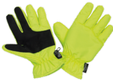
G-131 Hi-Visibility Insulated Glove, 100% Nylon Shell, Gripper Palm, 3M Thinsulate® liner Sizes: S – 2XL Color: Lime/Yellow