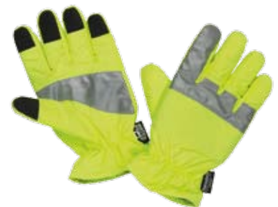
G-136 Hi-Visibility Reflective Glove, 100% Nylon Shell, 3M Thinsulate® Liner, Silver Reflective Trim Sizes: S – 2XL Color: Lime/Yellow