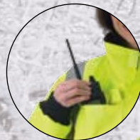
Cell Phone/ Small Radio Pocket