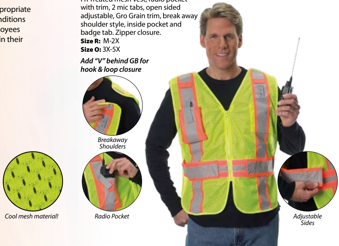
Cool mesh material!

Add "V" behind GB for hook & loop closure