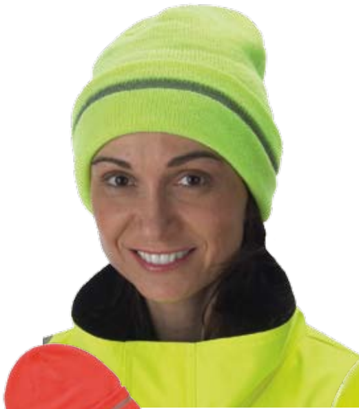
HAT-KNITCAP-R Hi-Visibility String Knit Cap 100% Polyester, Reflective trim Sizes: One size fits all Colors: Lime/yellow or Orange